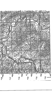
Scale 1:100 000

Station Name: Merrimallamb Station Code: ECRD Station Number: 10553 Station Name: Merrimallamb Station Code: ECRD Station Number: 10553